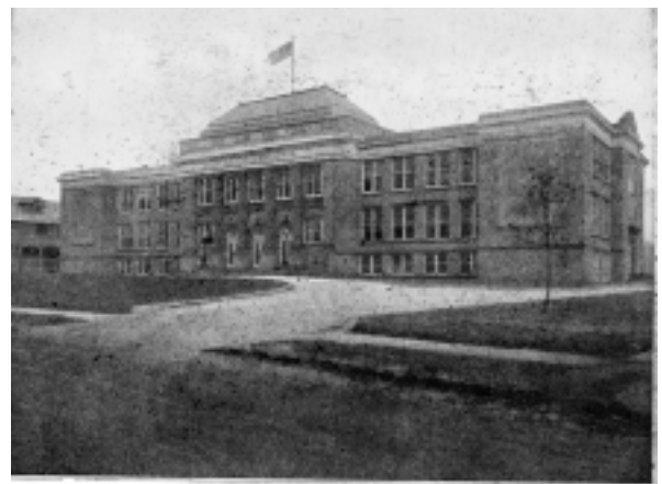
THE UPPER DARBY HIGH SCHOOL 1919

building that opened in 1919. It included a gymnasium with showers and locker rooms, considered the finest in the country at that time; a two-room library and an art room with overhead lighting. The teaching staff, now at seventeen, taught four curricula: Academic, Scientific, Commercial and General. The new school housed grades 7– 12 until 1930, when Upper Darby Junior High (now Beverly Hills Middle School) was opened to grades 7 – 9.