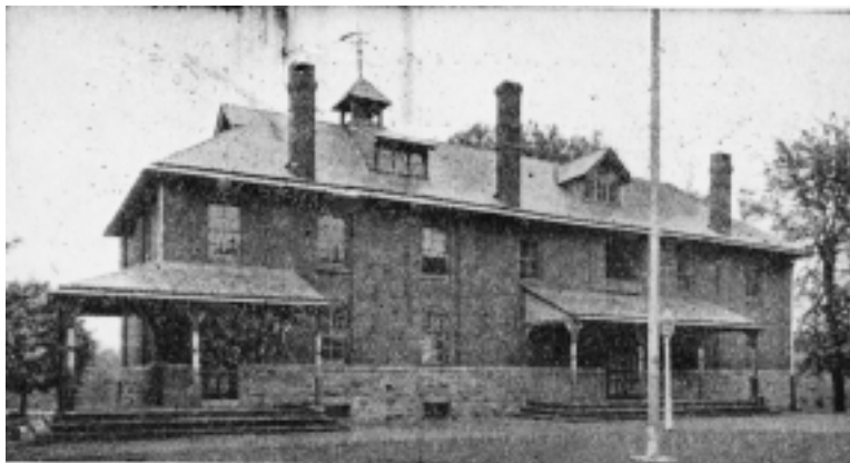
THE UPPER DARBY HIGH SCHOOL 1896